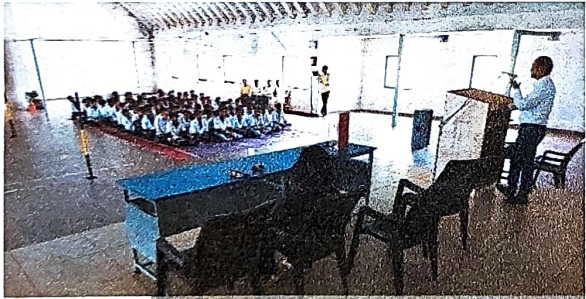
R4FG+X4X, Apati, Maharashtra 416201, India Apati Maharashtra India 27°C 81°F 2022-10-13(Thu) 12:10(pm)