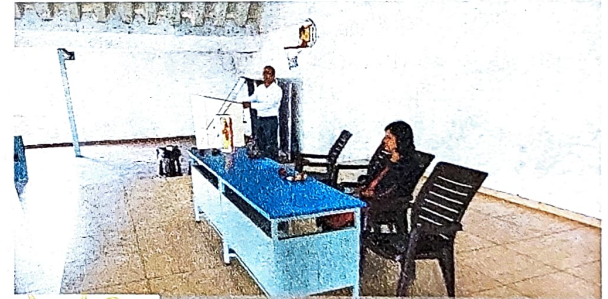
R4FG+X4X, Apati, Maharashtra 416201, India Apati Maharashtra India 27°C 81°F 2022-10-13(Thu) 12:10(pm)