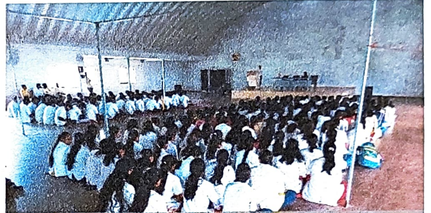
R4FG+X4X, Apati, Maharashtra 416201, India Apati Maharashtra India 27°C 81°F 2022-10-13(Thu) 12:09(pm)