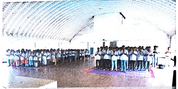
R4FG+X4X, Apati, Maharashtra 416201, India Apati Maharashtra India 27°C 81°F 2022-10-13(Thu) 12:02(pm)