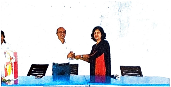
R4FG+X4X, Apati, Maharashtra 416201, India Apati Maharashtra India 27°C 81°F 2022-10-13(Thu) 12:04(pm)